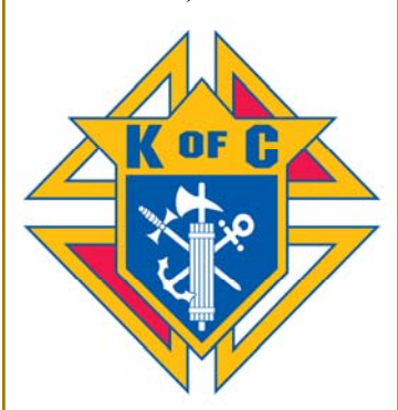
In Service to One. In Service to All

Knights of Co1umbus 180 S. Russell Ave Aurora, IL 60506